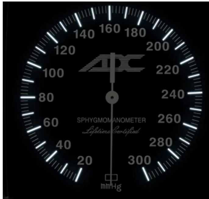
Gauge Image 1

ACTAACCT by Amarillo College TAACCT Grant is licensed under a Creative Commons Attribution 4.0 International License .