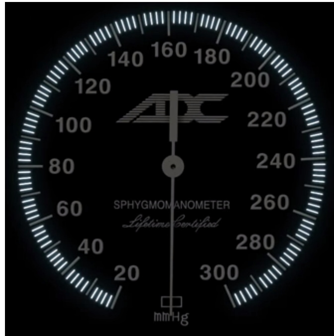
Gauge Image 2

7. The short lines on the gauge below represents units of _____.