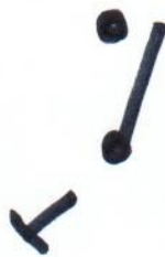
Single Pole Switch