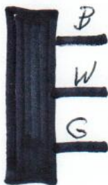
120v Power Source