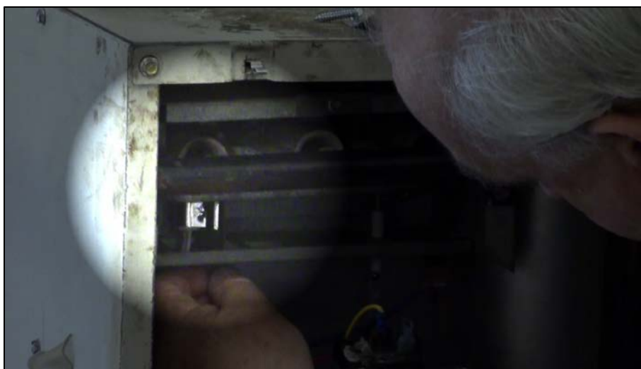
CAPTION 4. THE INSTRUCTOR MADE NOTE IN THE VIDEO THAT THE IGNITER IN THE FURNACE IS STILL IN GOOD SHAPE, AND INSTALLS IT BACK IN THE FURNACE FOR DEMONSTRATION PURPOSES. HIGHLIGHTED ON THE PHOTO IS THE INSTRUCTOR PLACING THE IGNITER INSIDE THE FURNACE, AND GETTING READY TO SCREW IT BACK IN.