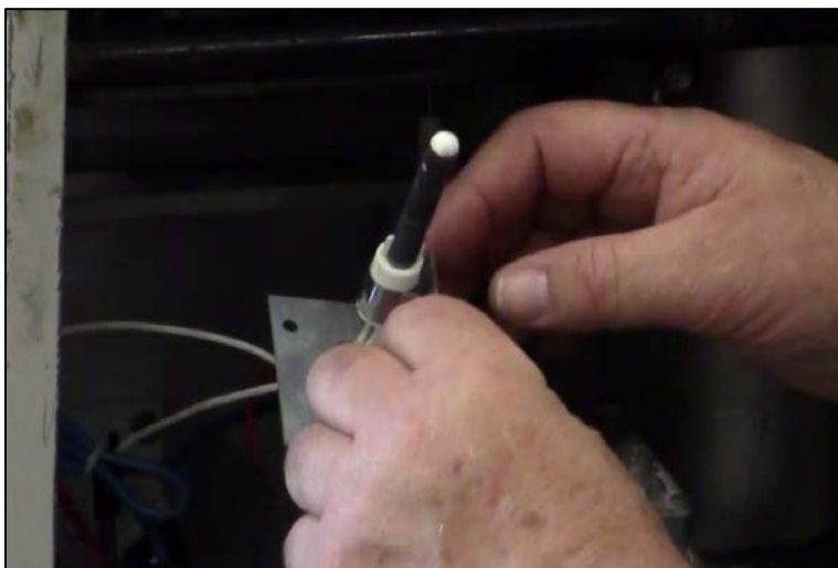
CAPTION 1. THE INSTRUCTOR PULLS OUT THE OLD IGNITER FROM THE FURNACE.