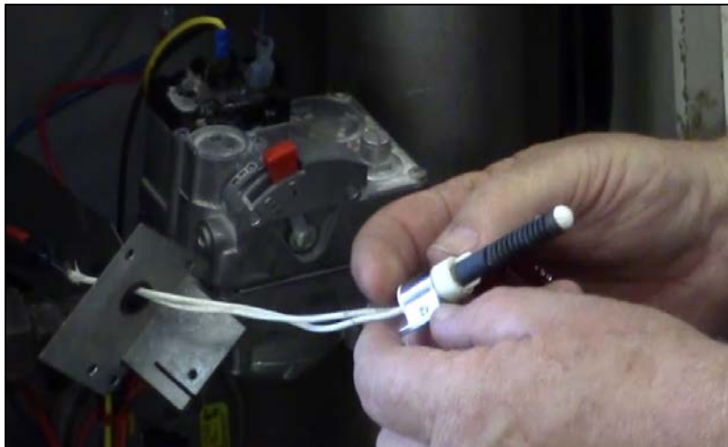
CAPTION 3. THE INSTRUCTOR UNSCREWS THE MOUNTING BRACKET FROM THE OLD IGNITER SO THAT THE NEW IGNITER CAN BE INSTALLED IN ITS PLACE.