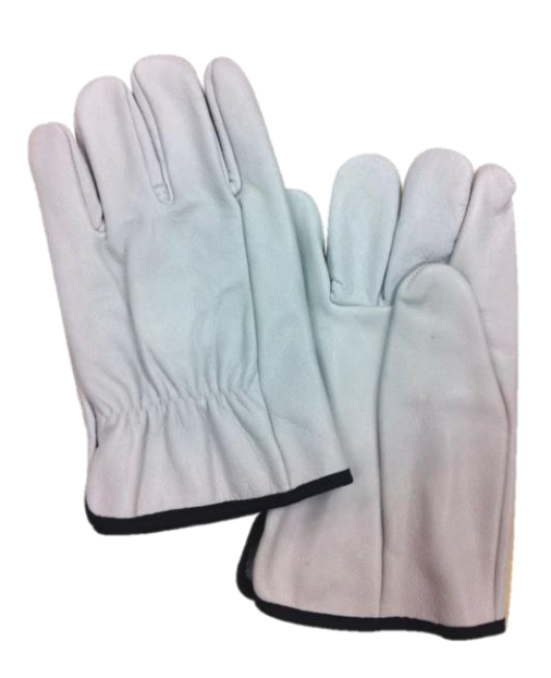
Electrical Glove Protector