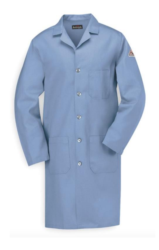
Flame Resistant Lab Coat