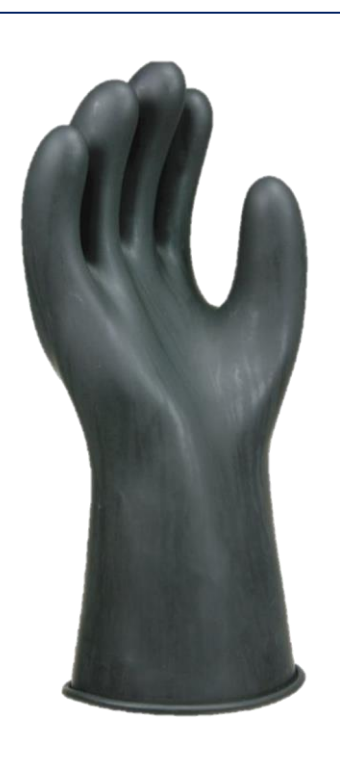
Electrical Gloves, Class 00