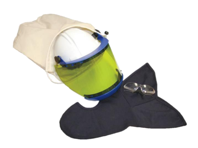
Arc Flash Head Protection Kit