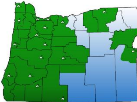
Locations of the 17 community colleges in Oregon.

All of the 17 community colleges have adopted the three “C” strategies: Career Pathways, Credit for Prior Learning, and Career Coaching.