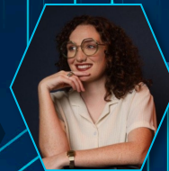
Jaesa Rogers Hagerty Consulting