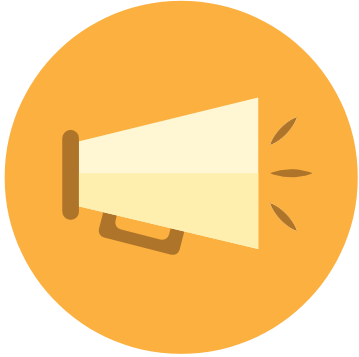
IMAGE & OUTREACH