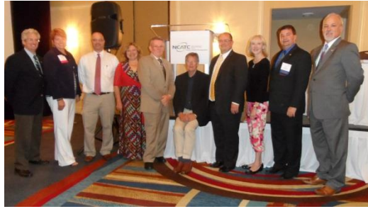
2015 NCATC Board of Directors in Houston, Texas.