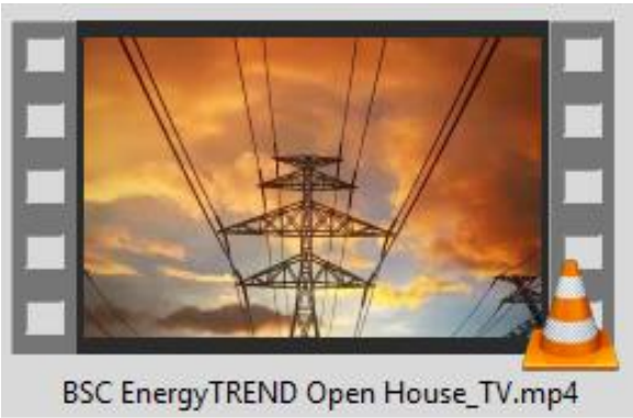
BSC EnergyTREND Open House_TV.mp4