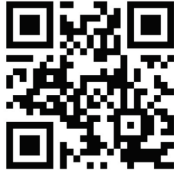
ALLISON B. UNDERWOOD