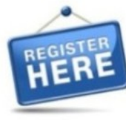
Register for Classes