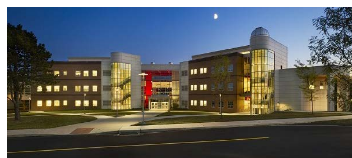
Labs located in the Advanced technology Center

The Montgomery County Community College (MCCC) Serves as the lead for the Biomanufacturing HUB in the Community College Consortium for Bioscience Credentials (c 3 bc). The c 3 bc is a initiative to develop and offer training and educational programs for entry into high-paying jobs in the biosciences' workplace.