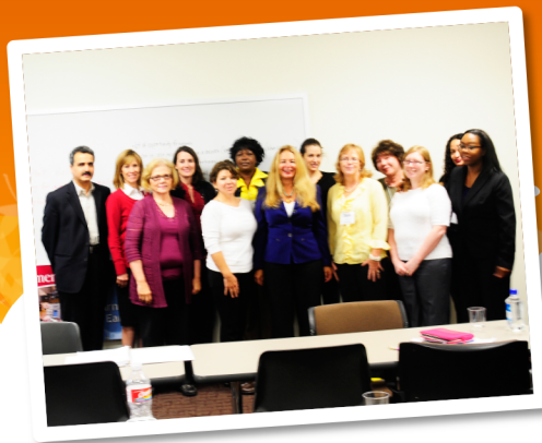
Above: NISGTC consortium members pose after the closing of their IWITTS training.