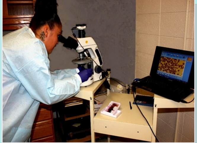
A student examines a blood smear as part of the MLT 131 Introduction to Hematology Class.

The MLT program has begun its 3rd semester of the 5 semester block with stu-